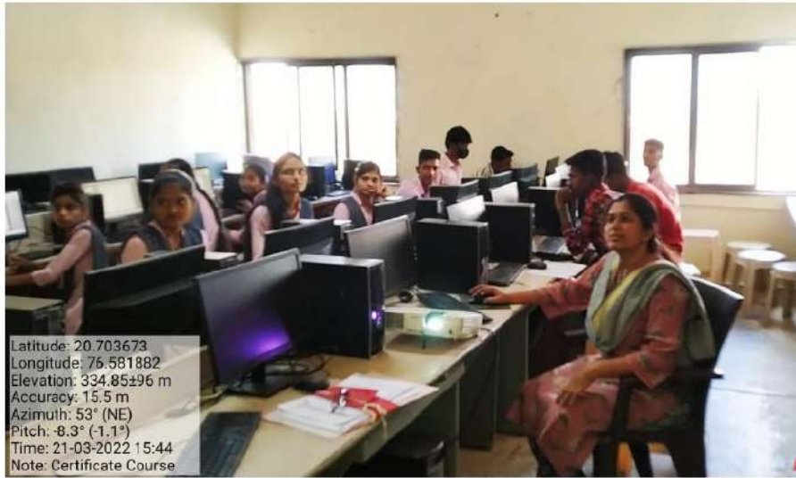
Latitude: 20.703673 Longitude: 76.581882 Elevation: 334.85±96 m Accuracy: 15.5 m Azimuth: 53° (NE) Pitch: -8.3° (-1.1°) Time: 21-03-2022 15:44 Note: Certificate Course