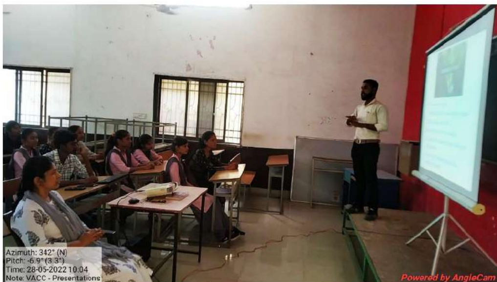
Azimuth: 342° (N) Pitch: -6.9° (-3.3°) Time: 28-05-2022 10:04 Note: VACC - Presentations