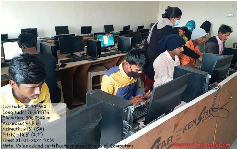
Latitude: 20.703542 Longitude: 76.581835 Elevation: 306.05±4 m Accuracy: 53.8 m Azimuth: 213° (SW) Pitch: -14.8° (-2.1°) Time: 01-01-2022 10:39 Note: Value added certificate course- Basis of Computers